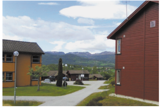
The view from student housing in Bø, Norway.