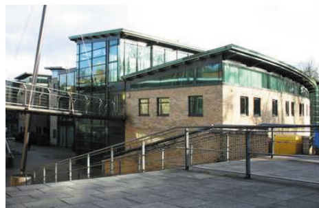
Kingston "Hill" Campus

If you and a friend are interested in studying abroad together visit the Office of International Programs to set up an advising session, and check out our featured programs at MinotStateU.edu/international .